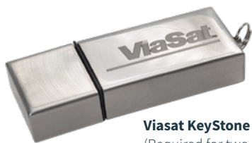
Viasat KeyStone (Required for two-factor authentication)